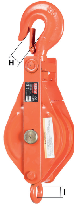
KBH2 with 2 wire rope sheave